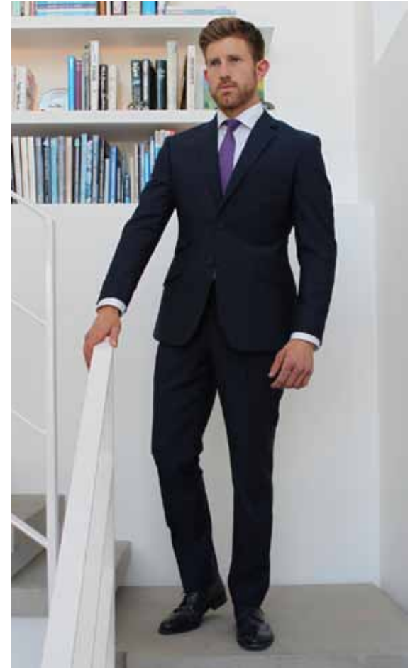
READY TO WEAR

HACKETT HUDSON HUGO BOSS JOHN SMEDLEY LOAKE MURDOCK LONDON